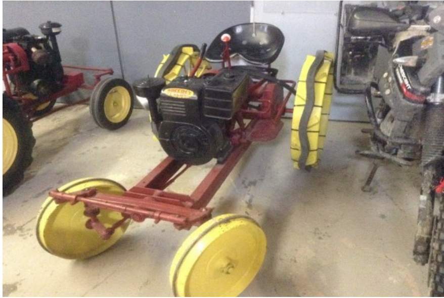
Speedex on Iron Wheels